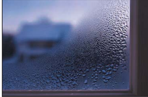
Condensation on the inside of a window-pane.